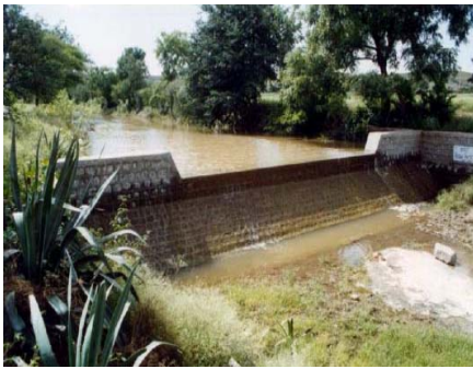
(c) Check dam along the drainage line